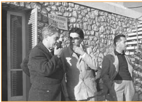
Joris Ivens discussing the shooting of L'ITALIA NON È UN PAESE POVERO (1960)