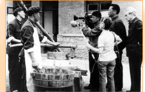
Joris Ivens and Marceline Loridan-Ivens during the shooting of COMMENT YU KONG DEPLAÇA LES MONTAGNES , 1976

Revisit of HOW YU KONG MOVED THE MOUNTAINS (1976)