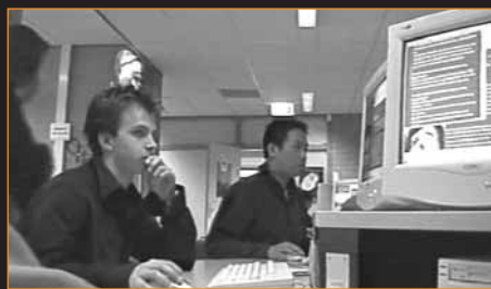
A class from the Dominicus College working on-line with the educational website 'The Flying Dutchman, a travel around the world with the films of Joris Ivens'.

The Foundation's bilingual website will be redesigned and modernised, to provide more information - relevant news, updates and background information (like essays). Because of the digitisation of both the paper collection and Ivens' films, it will soon be possible to make the resources of the Foundation available on-line and on demand for research. For example, THE BRIDGE and ZUIDERZEEWERKEN can already be seen on-line. The Hans Wegner Collection and Joris Ivens Archive will be accessible on the website.