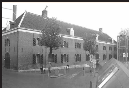
Since October 2004 the office is housed in the historical building Arsenaal in the cultural centre of Nijmegen.

After many years of temporary accommodation, the offices of the Foundation finally moved to the beautifully renovated Arsenaal building. This historical building, dating from the 18th century when it was a powderhouse, will contain a Belgian café, a cultural centre for all kinds of small films - and cultural institutions. Our Foundation has got a 60m office on the first floor and storage of 20m. The official opening of the building is planned for June 2005.