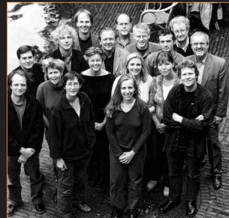
The ASKO-ensemble for modern music will perform live-music to Ivens-film in February 2005.

performed live with Eisler's score in Almere, the regional capital of the polders, reclaimed land that is quite literally new earth. The Louvre presented a programme about the change from silent to sound movies, showing several of Ivens' films in the presence of Marceline Loridan-Ivens. The renowned ASKO ensemble of modern music will also perform Eisler's score to NEW EARTH next year in Amsterdam and Utrecht. The new synchronisation of Rain will be presented at the Biennial Celebration of the Film Museum in 2005.