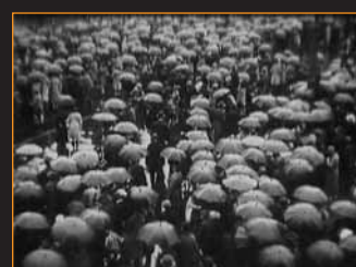
Series of film stills from RAIN - umbrellas in crescendo